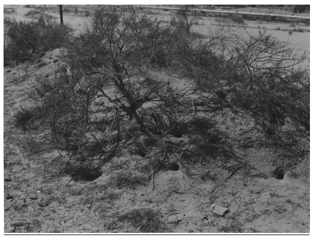
Figure 1. A View of Rodent Burrows in the Study Area, Southeast of Iran

permanent mounts were prepared using Puri's medium and identified by the relevant keys of sand flies (16). Sex ratio, (i.e. the rate of males per 100 females) was calculated for all species.