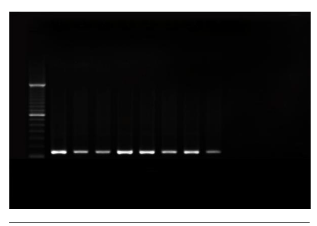
M, DNA molecular size marker (100-bp ladder); lanes 1-8, E. coli clinical isolates containing the fimH gene (150 bp); lane 9, negative control (without DNA template)

infections in human, especially infections of urinary tract caused by E. coli (22).