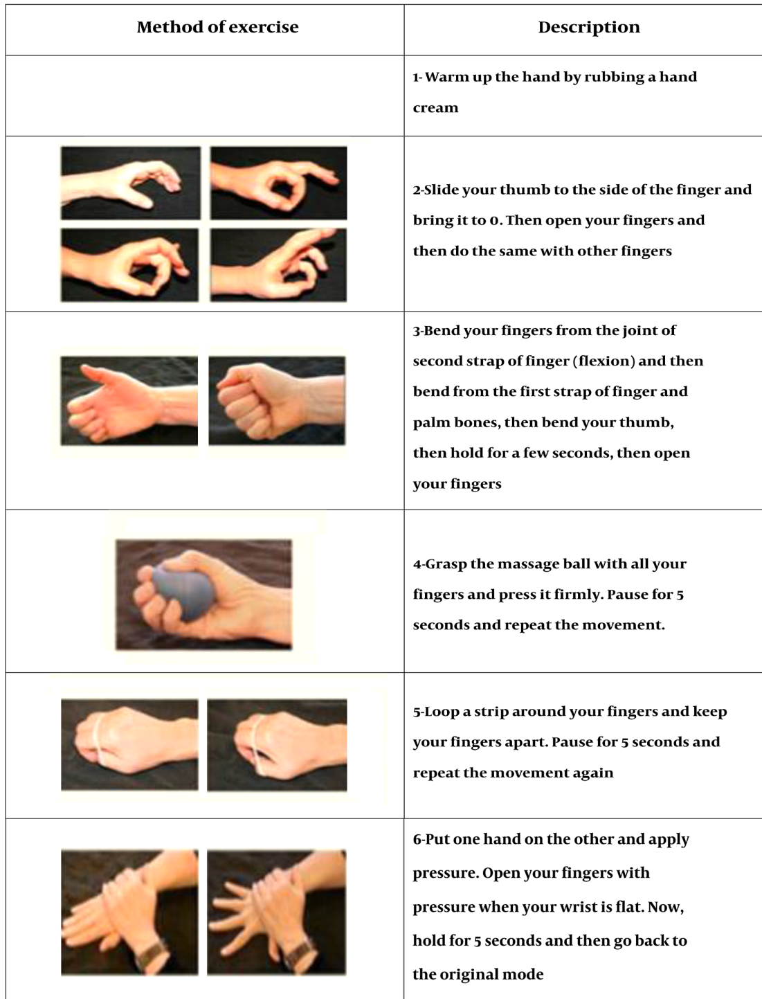
Figure 1. Hand strength exercise protocol (11)

months. The results showed that the IL6 inflammatory factors in the aerobic group had a significant decrease.