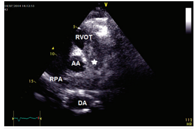
Figure 1. The Mass (*) Filling the Main and Right Pulmonary Arteries in Transthoracic Echocardiography. AA: Ascending Aorta, DA: Descending Aorta, RPA: Right Pulmonary Artery, RVOT: Right Ventricular Outflow Tract

Yet, pathological examinations of the surgical biopsy showed undifferentiated spindle cell sarcoma (Figure 3).