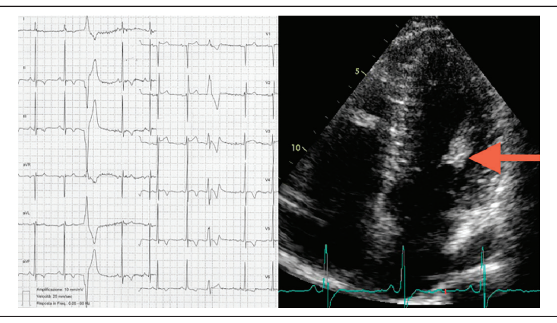
Right Panel, Echocardiography. Apical 4-Chamber Views Showing the Hypertrophic and Hyper-Echoic Anterolateral Papillary Muscle

Figure 1. Left Panel, Electrocardiogram. Left Ventricular Hypertrophy with T-waves Inversion in the Inferior and Lateral Leads and Ventricular Premature Beats