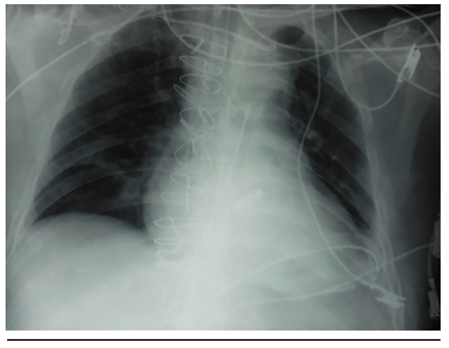
Figure 1. Baseline Chest x-Ray

Our patient was at a high risk of respiratory complications postoperatively. Specifically, he had a significantly long CPB duration due to his high operative severity and he was hemodynamically unstable during the early postoperative period with accompanying low cardiac output. Nevertheless, it is worth mentioning that our patient had a clear x-ray despite his severe and persistent hypoxemia on high FiO2 levels during his mechanical ventilatory support. He might have developed type IV respiratory failure, which occurs in the patients who are in shock or hypoperfusion states without the