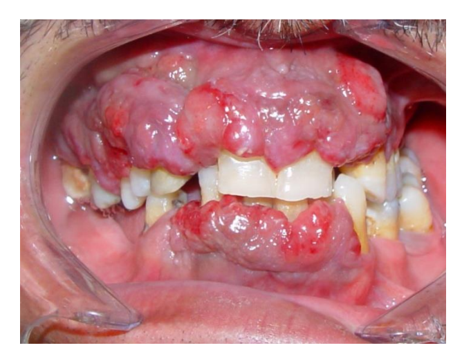
Figure 1. It shows the appearance of generalized proliferative gingival lesion in patient.

Laboratory test results were normal, so the patient's diagnosis was stated as inflammatory and reactive hyperplastic lesions.