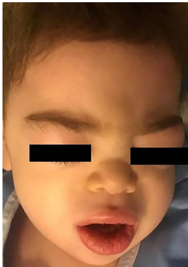
Figure 1. Facial edema: Swollen lips and eyelids of an 18-month-old boy with coronavirus disease 19 (COVID-19)-induced secondary hemophagocytic lymphohistiocytosis (sHLH) at the time of admission.

On the third day, the patient's general condition rapidly deteriorated further, with severe respiratory distress and hypoxemia, a decrease in consciousness level, severe irritability, and upper gastrointestinal bleeding. Additional laboratory tests revealed a progressive decrease in platelet counts and hemoglobin level, hypofibrinogenemia, hypertriglyceridemia, and hyperferritinemia (Table 1), which suspected the presence of sHLH. Bone marrow aspiration and biopsy were not done due to the unstable condition of the child and non-adherence of the parents. NK cell activity and soluble CD25 were not evaluated because of insufficient laboratory facilities. The level of interleukin-6 (IL-6) was in the normal range (4.09 pg/mL; normal range: \leq 7 pg/mL). New chest CT showed peripheral ground-glass opacities and also complete consolidation in the upper and middle thirds of the thorax, which was highly suggestive of ARDS of COVID-19 (Figure 1B). The results of PCR indicated severe acute respiratory syndrome coronavirus 2 (SARS-CoV-2) infection.